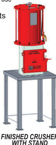
FINISHED CRUSHER WITH STAND