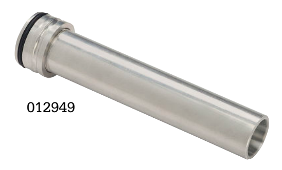
Falcon Quick Disconnect Spout Assembly