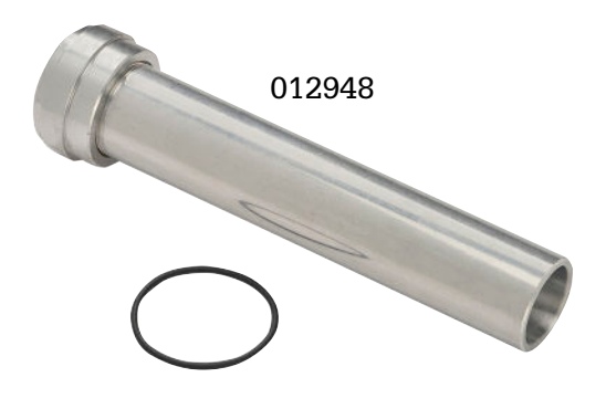
Falcon Nut Spout Assembly