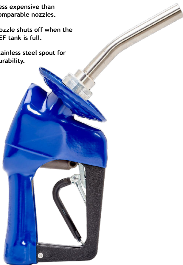
X DEF Plastic Nozzle Back Pressure Performance