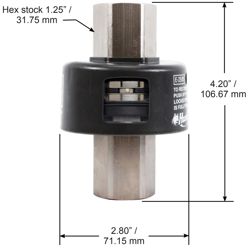
G2 E25/E85 Magbreak®