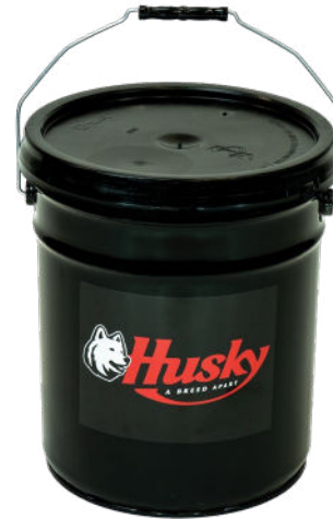
Part No. 007086

A customized logo can be printed on the Fuel Filter Cup upon request for an additional charge. For custom colors, a minimum order of 4,000 Fuel Filter Cups will be required.