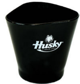
Part No. 007004*