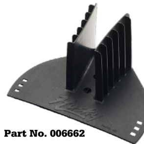
Part No. 006662