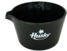
Part No. 007000