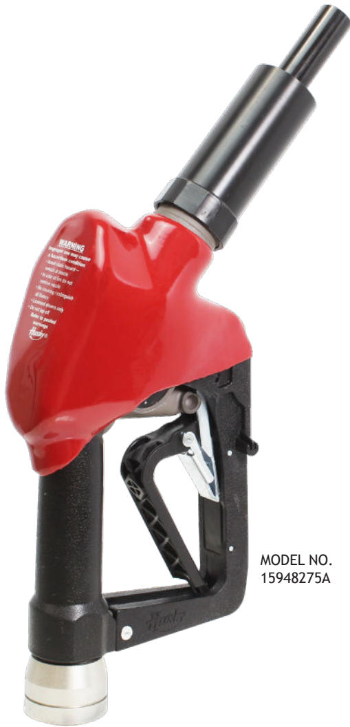
MODEL NO. 15948275A