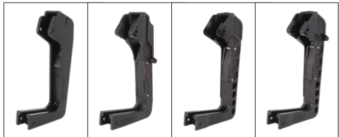
Wayne Polymer Handguard (with or without Magnet)