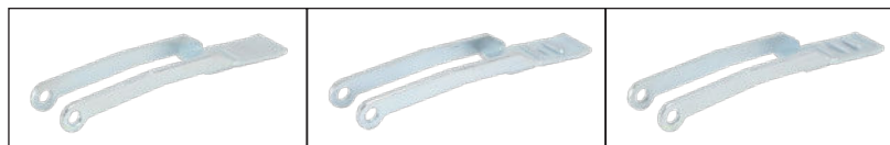
3 - Position Latch Plate