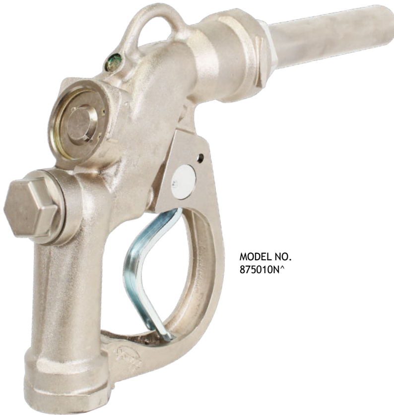
MODEL NO. 875010N^