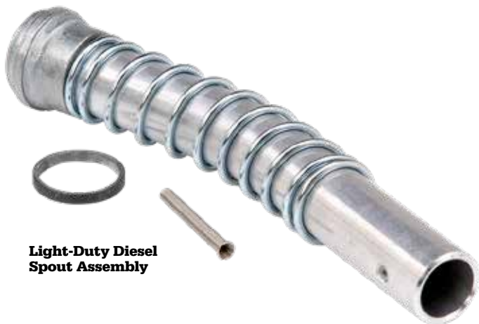
Light-Duty Diesel Spout Assembly