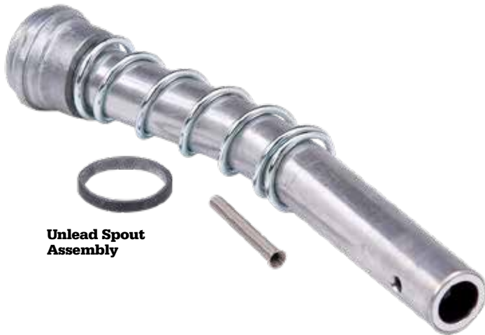
Unlead Spout Assembly