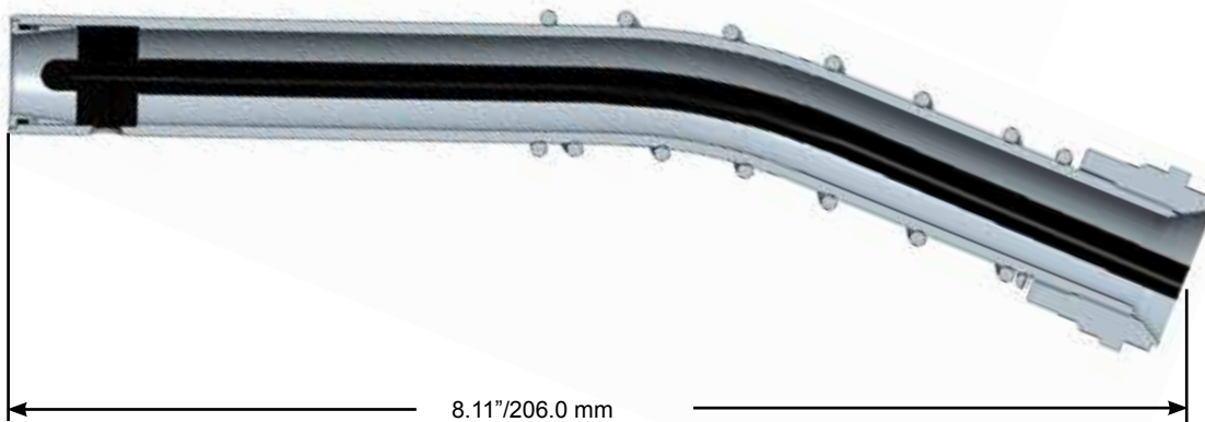
Light Duty Diesel Spout