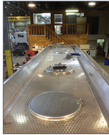
Main tank ports on top of vehicle

Fueling systems with overwing fueling hoses/nozzles may not be set up for fuel recirculation and flushing with 500 gallons may be impractical. Flushing can be accomplished by either putting the fuel into a disposal or holding tank which may be mounted on the truck or by rerouting through the portals on top of the truck's main tank ( taking appropriate fire safety precautions ). Consider flushing small bore hoses with a minimum of 10 times the hose fill volume. Once completed, recheck the fuel before beginning fueling operations.