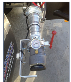
Single-Point Recirculation Valve

Hoses with single point nozzles in fixed or mobile fueling systems that are set up for recirculation should follow EI 1540 recommendations for new hose commissioning and be flushed with 500 gallons of fuel.